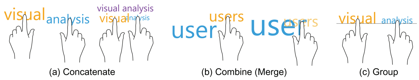
Figure 3: WordlePlus provides two-word manipulation using natural interaction. (a) Concatenation. Overlapping two words with one finger for each word creates a concatenated phrase. The original two words shrink as only the standalone occurrences of each word count. (b) Combining. Overlapping a word "users" onto another word "user" combines two words. The word "users" becomes bigger as the frequency of the word increases to the sum of the two words' frequencies. People can preview the increased size of the word "users" while holding their finger on the word "users." Once the finger released, the word "users" disappears (now shown). (c) Grouping. Aligning two words links the words as a group. Grouped words move/rotate together.

To make the wordle consumption experience more engaging and exciting, we enable wordle authors to add animation to wordles. To support a more flexible animation, we decide to provide a two-phase animation: for creation and for emphasis. Animation for the creation phase