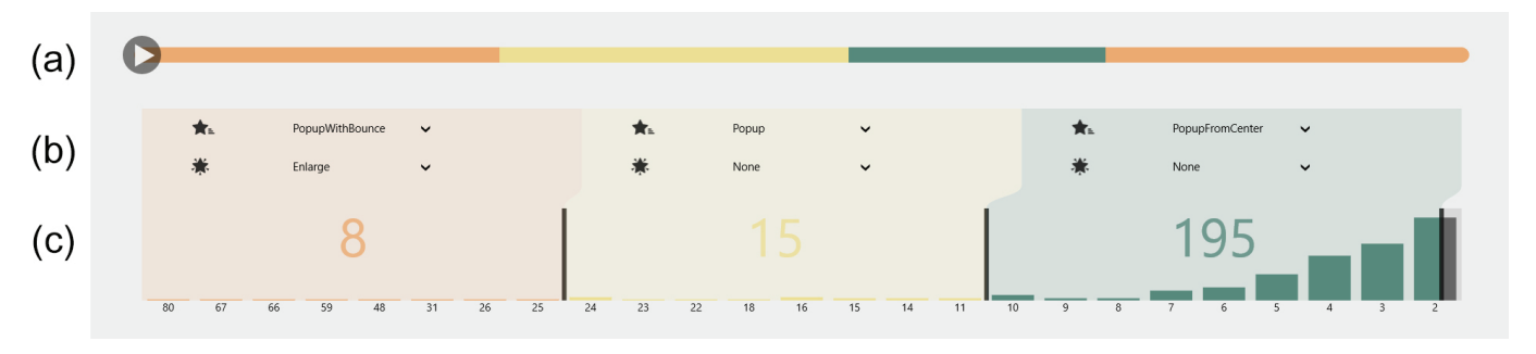
Figure 5: An initial design of the animation configuration panel; six animation selectors were arranged in two rows by group and the signifiers for animation phase separators and group separators were not clear. The final, improved design is shown in Figure 2.

People can select one repeat option using radio buttons next to the animation play bar (Figure 2b). Repeated animations are represented with an overlapped bar on the play bar (Figure 2b, orange and yellow bars on the right).