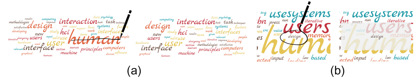
Figure 4: Pen interaction. (a) People can strike through a word to remove it; after the word disappears, words that are located at the boundary of the wordle move to fill the blank area. (b) People can draw a circle that encompasses the word to select a word too small to be selected with a touch; upon selection, a handle for manipulation appears.

by using a pinch gesture. She drags the word to the center of the wordle.