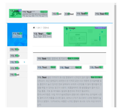
Figure 2: Interface we used to generate the dataset for CNN training