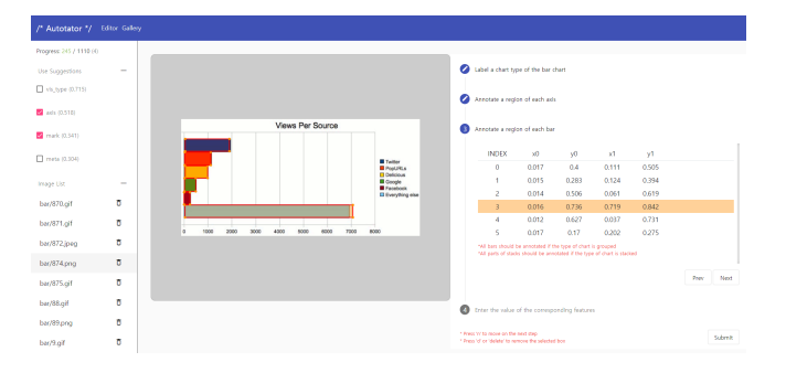
Figure 1: The web-based interface of Autotator. Annotation tasks are displayed on the right side using an accordion interface. An annotator is annotating bounding boxes of bars in a bar chart.

We develop CNN-based predictors for the tasks and train the predictors each time a specific amount (e.g., 100) of new annotated images are collected. As more annotated images are provided by human annotators, the predictors